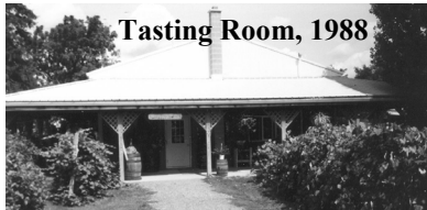
Tasting Room, 1988

of 5 wines totaling 1200 cases. It sure looked like a lot of wine to us back then, but our tiny tasting room with a tasting bar that was only about 6 feet long was able to sell that first vintage out by the end of the year. Things sure have changed over the years as Swedish Hill now produces over 60,000 cases of 30 different wines (not counting our Goose Watch or Penguin Bay brands). Our original tasting room later became the winery lab and currently is our prep kitchen for events at the winery. The original bottling room and warehouse (sounds bigger than it was) is now our em-